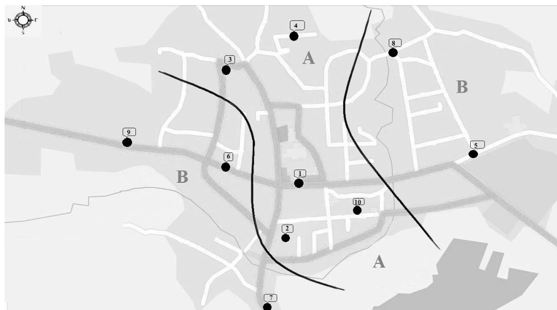
Fig. 2. Investigated spots and zones of different air pollution levels in the city of Blace using lichens as bioindicators. Black dots indicate investigated spots, while the letters A and B indicate lichen desert and struggle zone, respectively.

In 24 points in Blace and the surrounding rural area, 25 lichen taxa from 19 genera were found (Table 3). The most frequent species were Xanthoria parietina (95.8 %), Phaeophyscia orbicularis (83.3 %), Physcia adscendens (83.3 %), Evernia prunastri (75.0 %), Parmelia sulcata (70.8 %), Melanelia subaurifera (66.7 %) and Candelariella xanthostigma (66.7 %). Other taxa have significantly lower frequency.