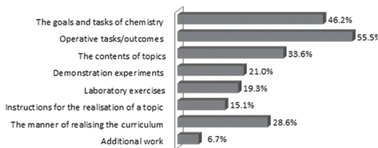
Fig. 1. The importance of information mediated through curriculum components ( N = 119 ).

out as informative by a small number of the teachers, who found the component the manner of realising the curriculum more useful. The low frequency of selecting these two components was probably connected with the fact that, within the current curricula, neither of them provides specific but generalised instructions. The fewest teachers (6.7 %) singled out the curriculum component pertaining to additional work with students as useful. In other words, apart from the obligatory segments of teaching, teachers find very little information in the curricula of use for additional work with those students who, in keeping with their interests and knowledge, should be offered additional contents.