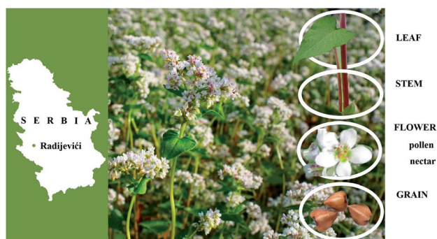
Fig. 1 Buckwheat samples (leaf, stem, flower, grain, pollen, nectar) collected in Serbia, Nova Varoš, Radijevići (43°23'31" N; 19°52'20" E).

All samples were taken from the buckwheat plant ( Fagopyrum esculentum Moench) species ‘Novosadska’ cultivated in a small locality in Western Serbia, in a village Radijevići (43°23'31" N, 19°52'20" E) (Fig. 1). Samples were harvested at the flowering season of buckwheat during the full nectar secretion, in July 2017. Buckwheat plant organs such as leaf, stem, flower, and