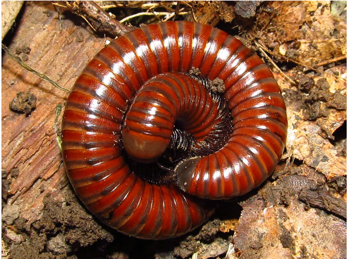
Fig 2. Pachyiulus hungaricus (Karsch, 1881) from Mt. Avala, near Belgrade.