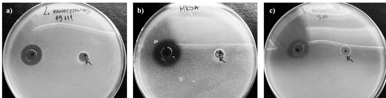
Fig 3. In vitro effects of the defensive secretion against L. monocytogenes (a), methicillin-resistant S. aureus (b) and X. arboricola (c). K) Negative control of solvent.