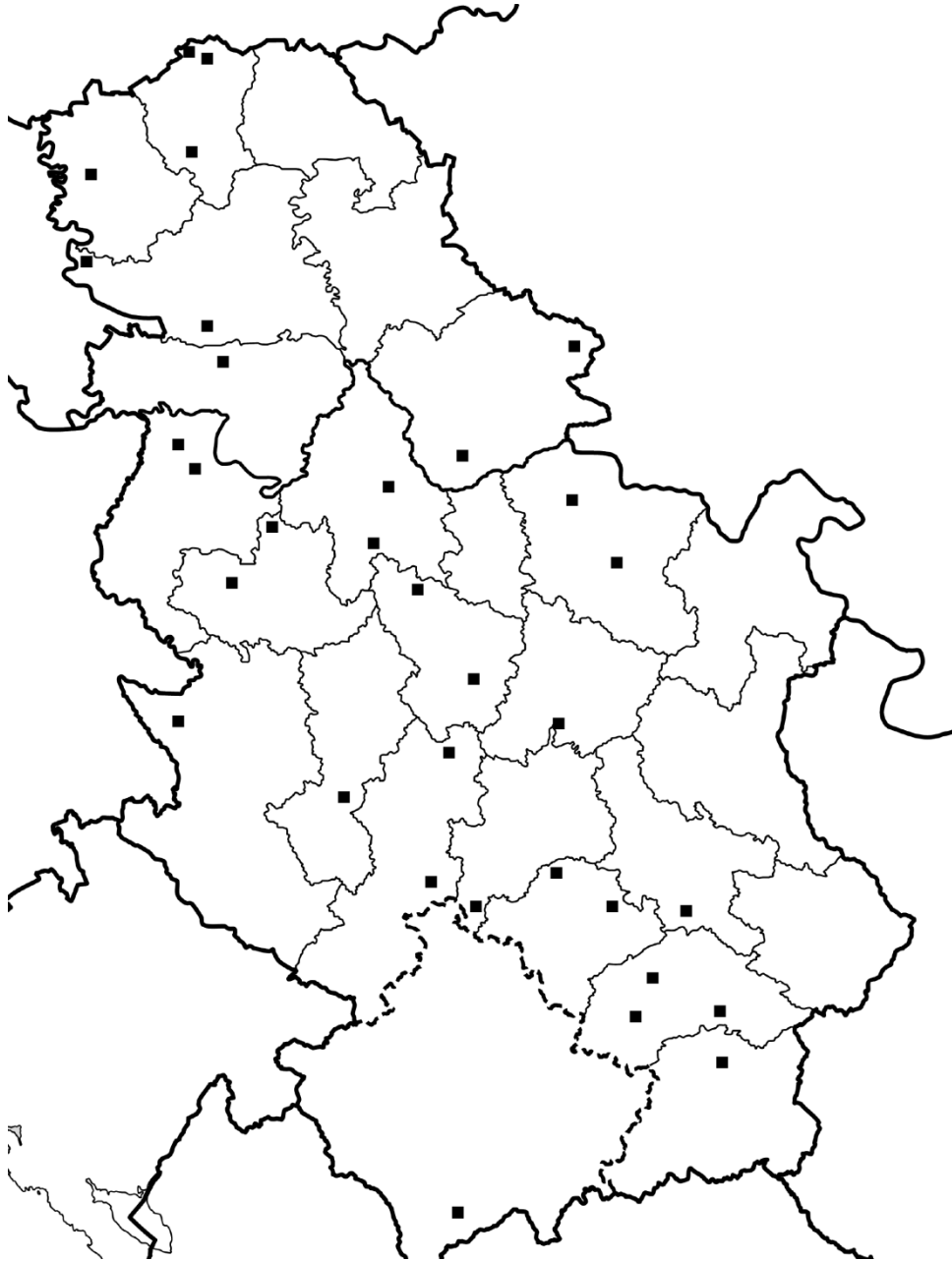
Figure S1. Regional map of Serbia with marked locations where propolis was sampled.